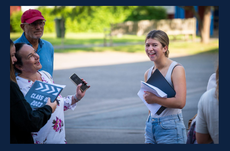
are pleased to report our summer results for 2023 that re-enforce Ofsted's quote, "The ambition for pupils at Maidstone Girls Grammar School (MGGS) is limitless."

Summer 2023 has seen our Year 11 and 13 students achieve some fantastic results, which is a result of their hard work and resilience especially over the last two years. Students have demonstrated their commitment to their education. I am so pleased for each and every student's personal achievement and delighted with the overall achievement of the year groups.